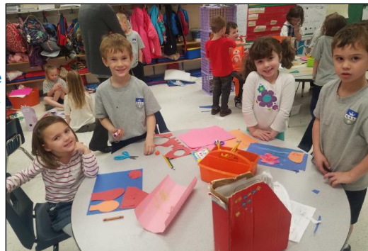
PK4 students visiting kindergarten and getting help from the experts! (above)