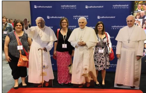
Teachers visiting with the Popes at NCEA Convention (below)