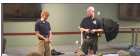
7th & 8th Grade SS field trip to STL court houses (left & above)

QAS Introduces the first ever Knights Summer Camp for current K-5th graders!