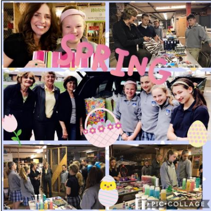
6th Grade helping St. Vincent de Paul Society (above)