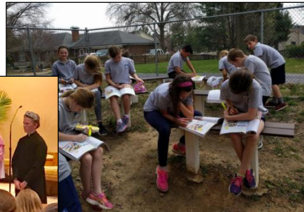
4th Grade outside learning while enjoying the beautiful weather (above)