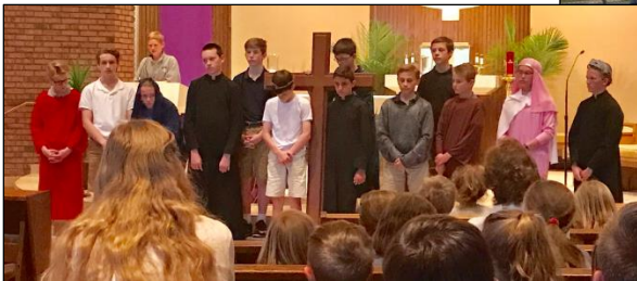
7th Grade Living Stations of the Cross (above)