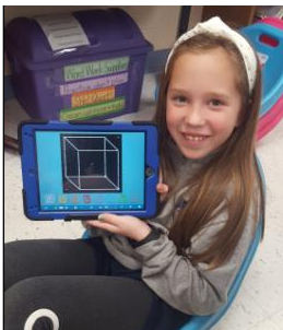
2nd Grade geometry lesson (left)