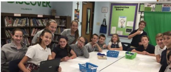
First STUCO meeting of the year with the newly elected members (above)