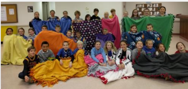
4 th grade annual service project making blankets for a homeless shelter (left)