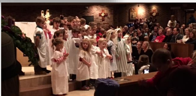
Preschool Christmas Program (right)