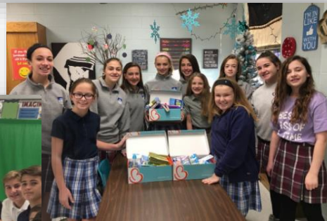
School-wide Christmas service project "Operation Show Box" with St. Vincent de Paul Society (above)