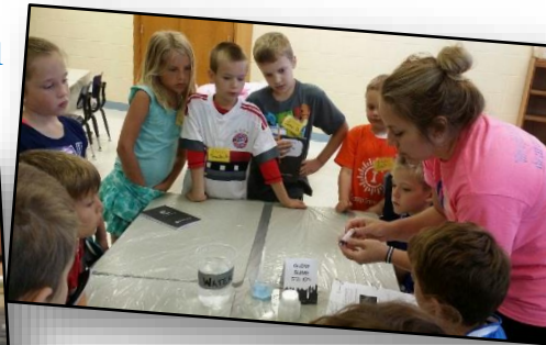
This summer's Vacation Bible School another huge success thanks to the volunteers and hundreds of students who participated (left)